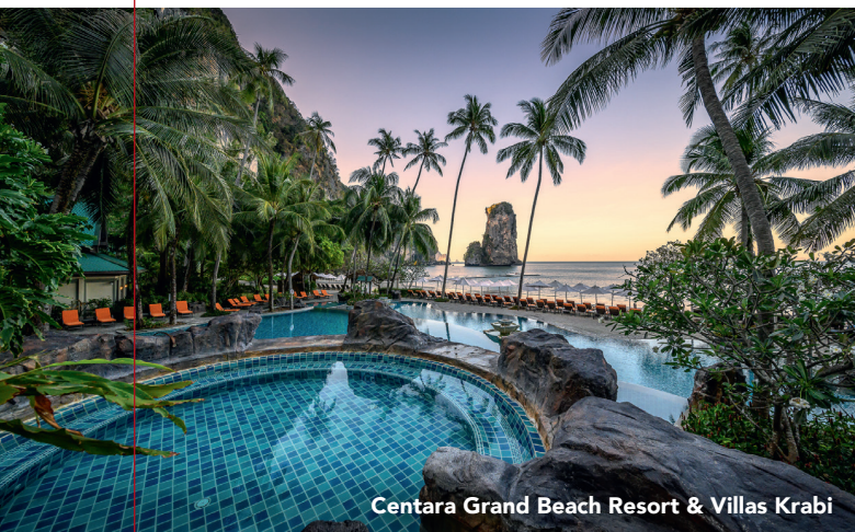
Centara Grand Beach Resort & Villas Krabi