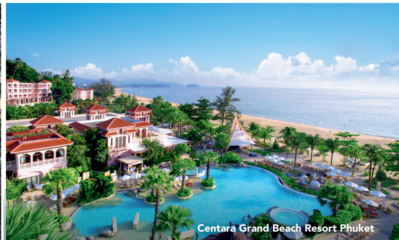
Centara Grand Beach Resort Phuket